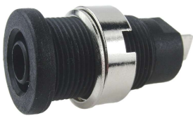
FCR7357B S16N BLACK WNW SOLDER TAG VERSION