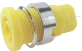
FCR7357Y S16N YELLOW WNW SOLDER TAG VERSION

Shrouded, 4mm, nickel or tin plated socket. Mates with shrouded or unshrouded plugs. Rated 1000V, CAT III. 24A for Solder tag Supplied with M12 slotted ring nut and washer.