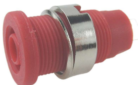
FCR7357R S16N RED WNW SOLDER TAG VERSION