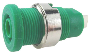
FCR7357G S16N GREEN WNW SOLDER TAG VERSION