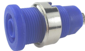
FCR7357L S16N BLUE WNW SOLDER TAG VERSION