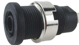
FCR7357B S16N BLACK WNW SOLDER TAG VERSION