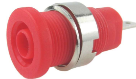
FCR73575R S16N/4.8 RED WNW