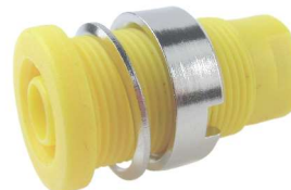
FCR7357Y S16N YELLOW WNW SOLDER TAG VERSION

Shrouded, 4mm, nickel or tin plated socket. Mates with shrouded or unshrouded plugs. Rated 1000V, CAT III. 24A for 4.8mm Faston and Solder tag 32A for 6.3mm Faston Supplied with M12 slotted ring nut and washer.