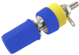
CL1552 - TP2 BLUE UNASSEMBLED