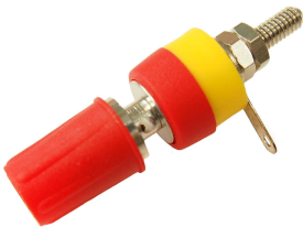
CL1551 - TP2 RED UNASSEMBLED CL1572 - TP2 RED ASSEMBLED