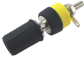
CL1550 - TP2 BLACK UNASSEMBLED CL1575 - TP2 BLACK ASSEMBLED