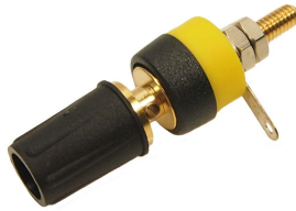
CL15501 - TP2 BLACK GOLD UNASSEMBLED CL15501A - TP2 BLACK GOLD ASSEMBLED