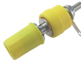
CL1557 - TP2 YELLOW UNASSEMBLED

Current Rating: 15A. Flammability: Min UL94HB