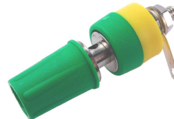
CL1553 - TP2 GREEN UNASSEMBLED CL1573 - TP2 GREEN ASSEMBLED