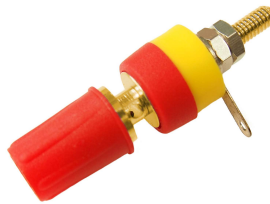
CL15511 - TP2 RED GOLD UNASSEMBLED CL15511A - TP2 RED GOLD ASSEMBLED