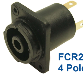
FCR2064 4 Pole Socket Solder Tags