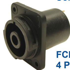
FCR20642 4 Pole Socket PC Tags