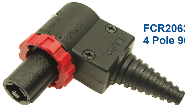
FCR2063 4 Pole 90° Plug