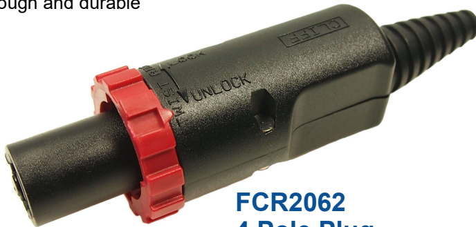
FCR2062 4 Pole Plug