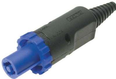
FCR2066 - 4PC/P/LV