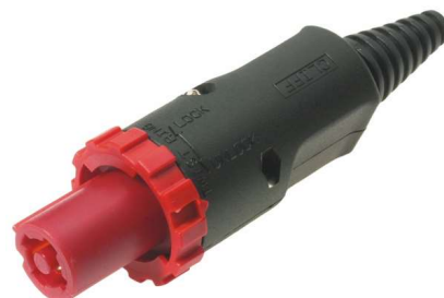
FCR2067 - 4PC/P/HV