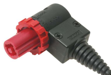
FCR20673 - 4PC/P90/HV