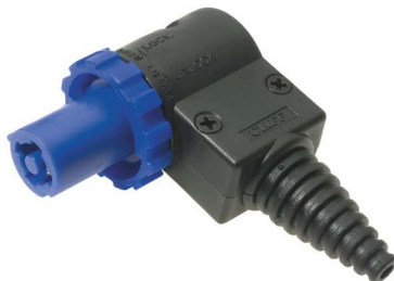
FCR20663 - 4PC/P90/LV