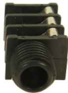
FCR50051 - S1 Offset Jack Socket Stereo, PC Mounting