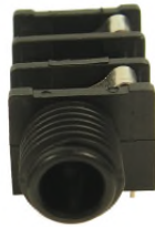
FCR50055 - S1 Offset Jack Socket Mono, PC Mounting